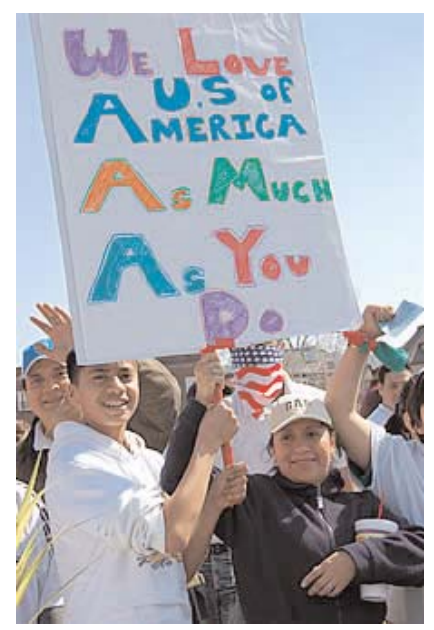
2006 immigrant rights march

2004: More than 2,000 members of Amalgamated Transit Union Local 1005 go on strike, shutting down Metro Transit bus service. As in many struggles, health care costs are a key issue.