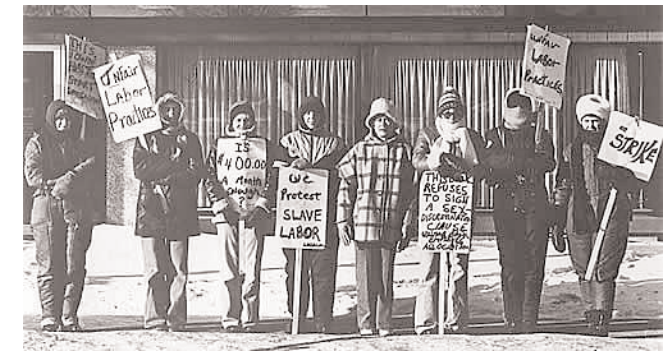
The Willmar 8

1962: President Kennedy signs Executive Order 10988 allowing federal employees to collectively bargain, although it remains illegal for them to strike.