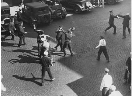
Scenes from the 1934 Minneapolis Teamsters' strike.

1934: Workers employed at the Pioneer Press and Dispatch in St. Paul and the Star, Journal and Tribune in Minneapolis form Local 2 of the American Newspaper Guild. In 1938, it takes a long strike - in which police use tear gas on pickets - before the Guild wins recognition at the Duluth daily newspapers.