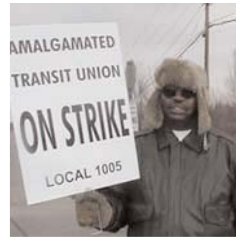
2004 Metro Transit strike

1992: Unions join with environmental, farm, faith and community organizations to form the Minnesota Fair Trade Coalition. Its immediate goal is to stop Congressional passage of NAFTA, the North American Free Trade Agreement; its long-term vision to seek alternatives to corporate globalization. The Minnesota organization is the only continuously operating, state fair trade coalition in the country.